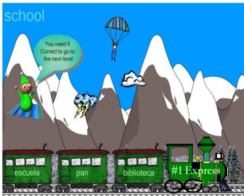
Fig. 1. Quick Drop game screenshot.